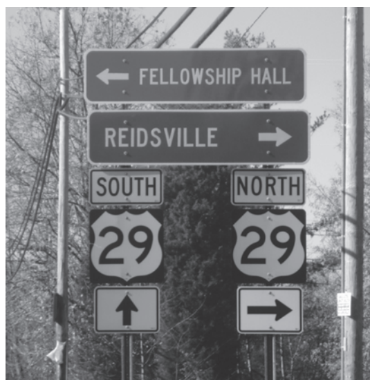
Fellowship Hall leads the way.

A journey reaches its destination. After a long-term effort with the State of North Carolina's Department of Transportation, Fellowship Hall now has directional signage on U.S Highway 29 exit at Hicone Road; additional signage is posted on Hicone Road.