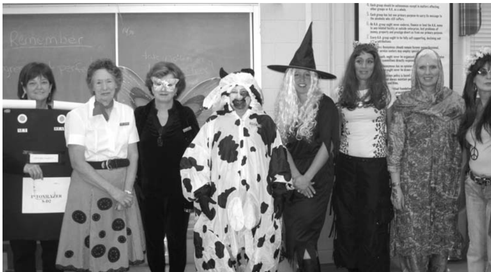
"A Costume Line" of Fellowship Hall staff.